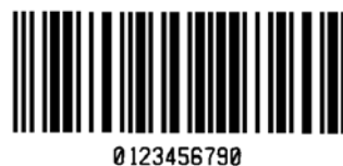
Interleaved 2 of 5