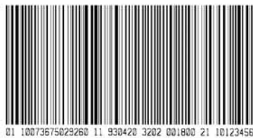
UCC/EAN Code 128 Random Weight