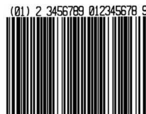
UCC/EAN Code 128