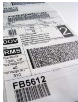
Military Shipping Label or MSL: This is the DoD label that has all the shipping and product information included.