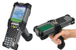
Handheld and fixed RFID Readers for accurate reading of encoded data.