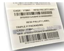
RFID Label: If you already have the shipping labels, you can add an RFID label—just like this example.

The RFID label is the simplest to make because it contains far less information than the others. That is if you have an RFID printer/encoder or you can use a label printing service to produce 100% compliant labels.