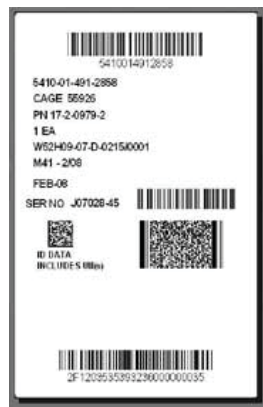
MIL-STD-129 Exterior Label: Normally you would use this along with the UPS or FedEx label. The label will look similar to that shown here to the left.

There are 3 exterior label possibilities: