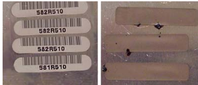
After Testing Results: New generation Polyimide Label (left) vs Standard Polyimide (right)

Shown here are the effects of time and temperature 315°/600° F for 50 minutes) on a standard polyimide labels compared to a new generation lead free polyimide labels. This new polyimide material is designed for the higher temperatures required for the lead free soldering processes.