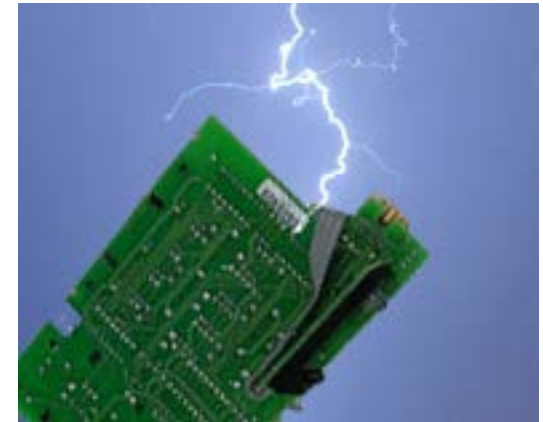
Moisture, temperature, materials and movement combine to create static charges which can damage printed circuit boards (PCB) and other sensitive equipment.

Durable label materials are designed to withstand PC board manufacturing processes and conform to REACH, RoHS, and HALOGEN FREE requirements of the electronics industry.