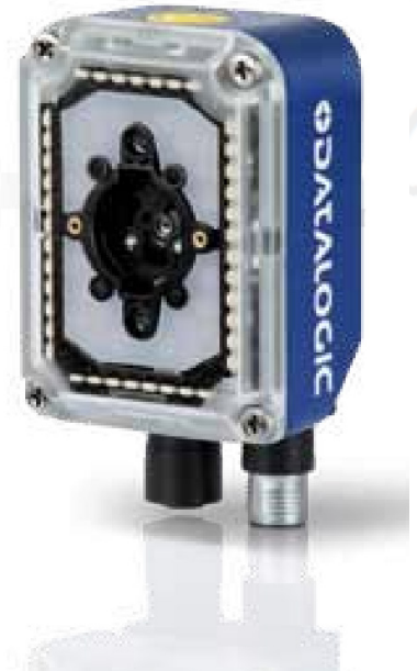
Matrix 2D Barcode Scanner

Which ID See! solution is right for you? Contact us today and we'll get you in touch with one of our specialists, right in your area. We will work with you to determine the perfect solution to meet your requirements.