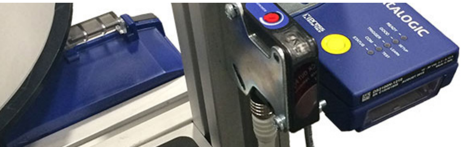
ID See! Linear for your GS1 barcoding