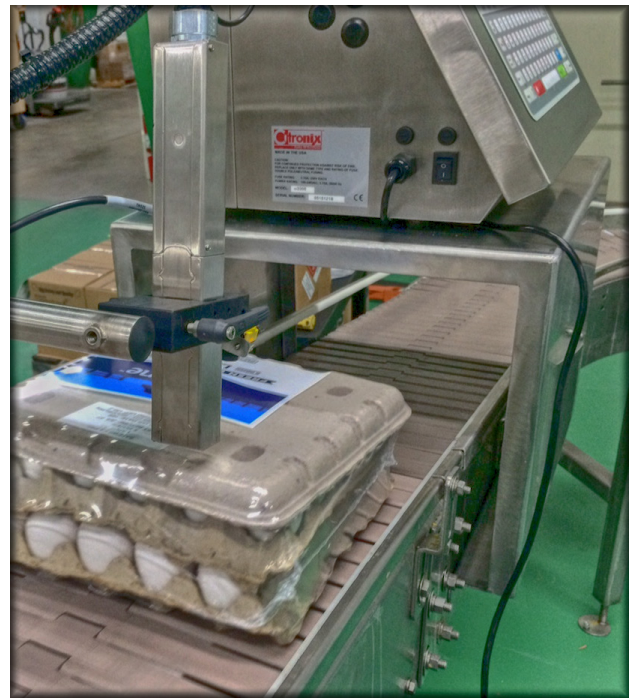
Citronix CIJ Printer Coding Egg Cartons

Need to upgrade traceability for your egg products? Contact ID Technology today!