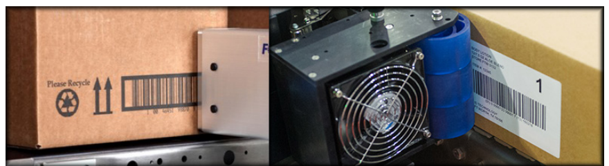
Case Marking & Labeling Solutions